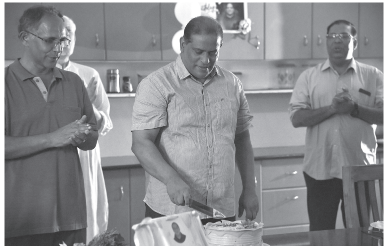
Birthday of our Provincial

The fraternal gatherings of our friars were held at Provincialate. The friars gathered in seven groups on their assigned days. Except the group of senior friars, all other groups gathered here. It was a celebration of brotherhood when the brothers came together and shared their experiences, we the