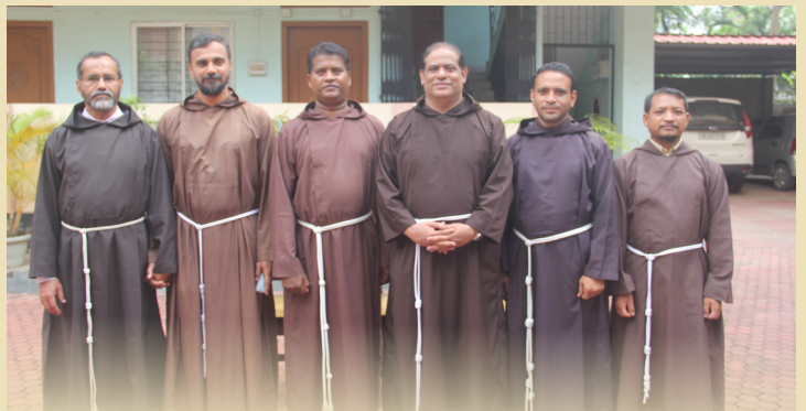
Custos & Councillors, Nirmala Matha Custody