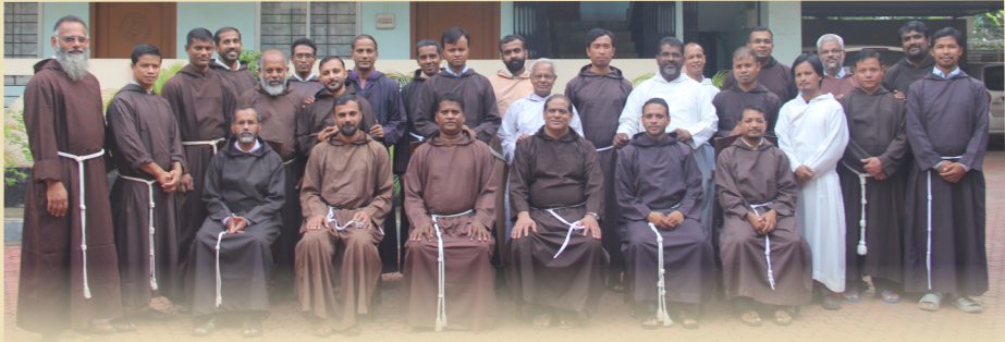
Friars of Nirmala Matha Custody