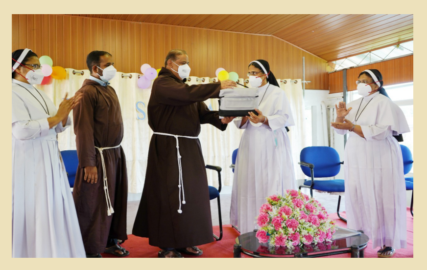
Initiatives from Assisi Hand at SH Hospital